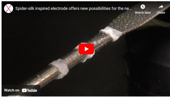
A demonstration of how the film contracts rapidly when in contact with water to wrap around tissue.

When the dry film comes into contact with water, the water breaks and dissolves the PEO structures, causing it to instantly contract to fit around tissues and organs seamlessly, like shrink wrap.